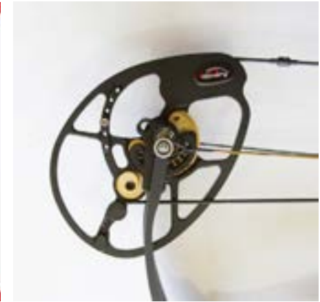
Fig. 1 - Use the power side (side with the module) for laser adjustments.

Install laser aligning tool on the power side of the cam (see Fig. 1) with the laser groove down. Be sure tool is not sitting on any raised areas (see Fig. 2) and the larger portion of the tool is hanging over the edge of the cam (see Fig. 3).