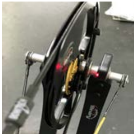
BT-X, BT-Mag, BT-Mag X