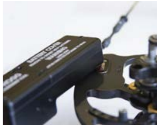
Fig. 2 - DO NOT sit the laser tool on any raised area of the cam.

To aid in proper initial set-up, refer to the images on the following page for proper laser/cam alignment for bows featuring the OverDrive Binary Cam System. These measurements should be performed equally on both top and bottom cams for proper performance.