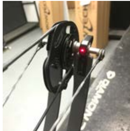
Fanatic, Fanatic 2.0, Fanatic 3.0