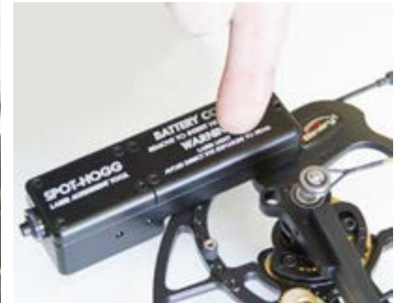
Fig. 3 - DO hang the larger portion of the laser tool off the edge of the cam.