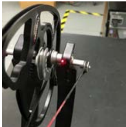
Reign 6, Reign 7, Experience, Insanity CPX, Insanity CPXL