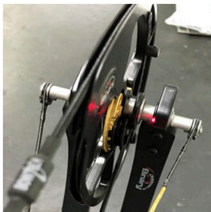
BT-X, BT-Mag, BT-Mag X