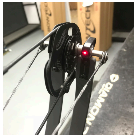
Fanatic, Fanatic 2.0, Fanatic 3.0