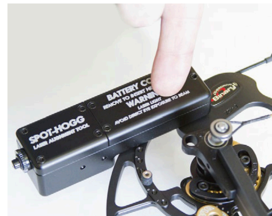
Fig. 3 - DO hang the larger portion of the laser tool off the edge of the cam.