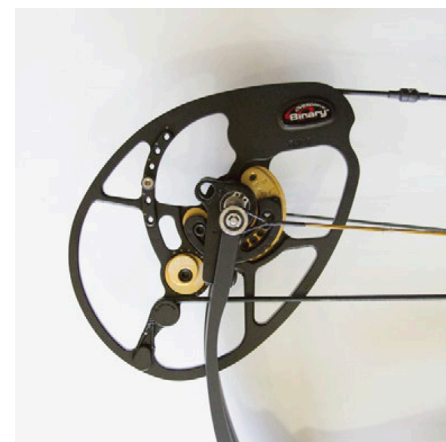
Fig. 1 - Use the power side (side with the module) for laser adjustments.

Install laser aligning tool on the power side of the cam (see Fig. 1) with the laser groove down. Be sure tool is not sitting on any raised areas (see Fig. 2) and the larger portion of the tool is hanging over the edge of the cam (see Fig. 3).