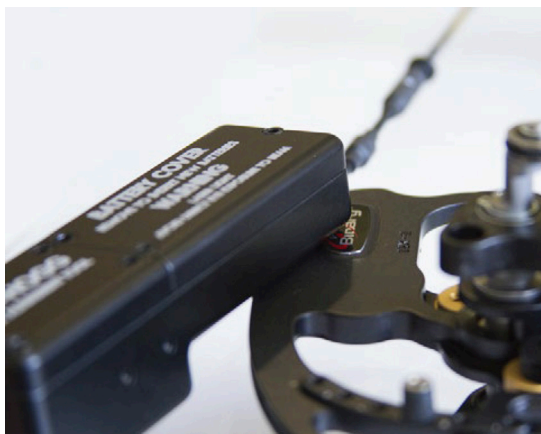
Fig. 2 - DO NOT sit the laser tool on any raised area of the cam.

To aid in proper initial set-up, refer to the images on the following page for proper laser/cam alignment for bows featuring the OverDrive Binary Cam System. These measurements should be performed equally on both top and bottom cams for proper performance.